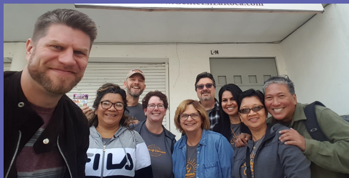
The COC Christmas Hope Project Team

We sent a team of 8 to Leon, Guanajuato (in Central Mexico) and worked with a local Pastor and their church. We held a morning prayer walk, shared the gospel, led individuals to Christ, and the next morning, gave away over 30 lunch bags with sandwiches, drinks, snacks, and bible to refugees on the streets.