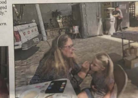
Face painting, crafts and a bounce house are some of the activities available for the kids.