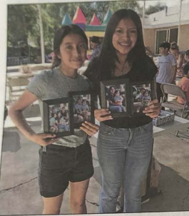
Photos were taken, printed and framed in order to give to members of the community their own family photos.

meet physical needs and share the hope of God's good news. The original plan was to take a team to Tijuana that day, to feed and serve the community in a very desperate area, Zona Norte, which is home to many rejected by society, due to drug addiction, prostitution and poverty. Circle of Concern partners with a local TI group that is educating street kids not in the traditional school system, to give them a better future. As well, every Saturday they feed over 250 in the community a hot meal, which may for some be the only meal they have that day. With the violence that occurred the Tijuana area, it was decided to postpone that trip until things have calmed down. But, with a volunteer team already in place, it felt wrong to cancel everyone's plans and so the team decided instead to come to Fallbrook where Pastor Marcello of Iglesia de Dios graciously opened his doors for the community event in his church's backyard.