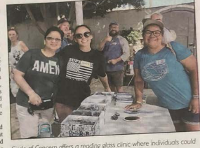
Circle of Concern offers a reading clinic where individuals could be fit for reading glasses.